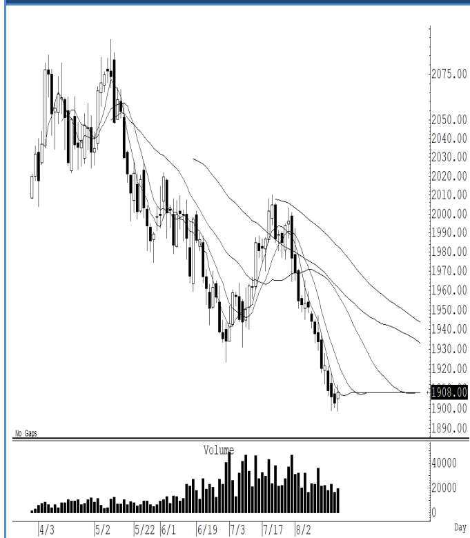
GOU23 (Close 1,908.0 Chg 5.30)

ราคาทองคำโลกเริ่มแกว่งออกข้าง ไม่ข้าม 1,920 ดอลลาร์ น่าจะ sideway down ต่อไป เราแนะนำยกการ์ดสูงหรือตั้ง stop ไว หรือแนะนำ trading ใน กรอบ 1,898-1,920 ดอลลาร์ รับรู้กำไร แต่ถ้ในกรณีที่มีปีต่ำกว่าระดับ 1,895 ดอลลาร์ แนะนำ ถือ short หวังผลปรับตัวลงไปแถว ๆ 1,850 ดอลลาร์ รับรู้กำไร